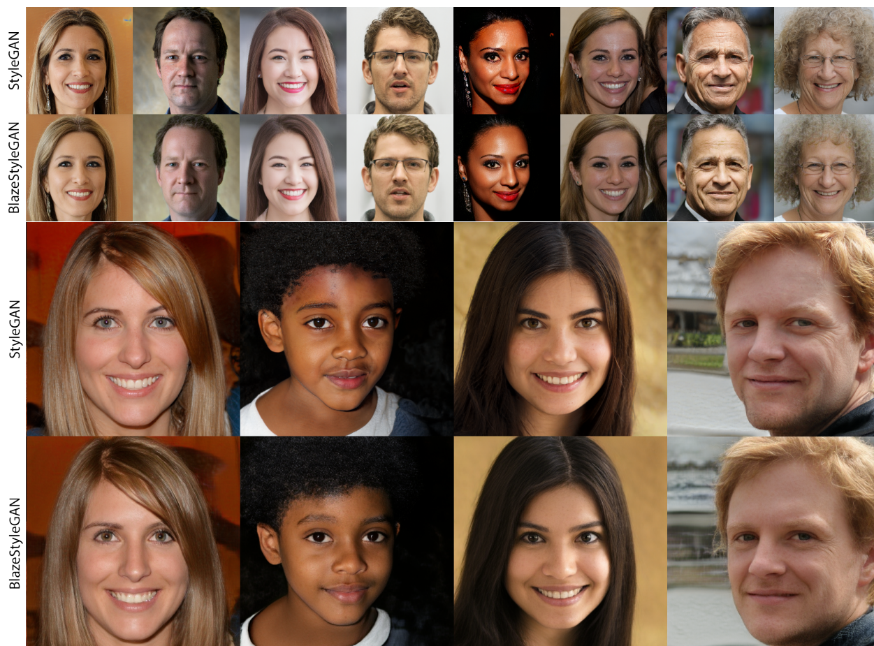
Figure 3. Generated images of teacher StyleGAN and our BlazeStyleGAN at 256 \times 256 (top two rows) and 512 \times 512 (bottom two rows).